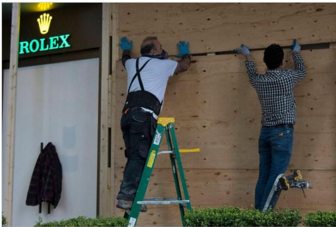
Workers board up a luxury store in downtown Vancouver, B.C., Thursday, March 26, 2020. Businesses have been forced closed by the city and the province due to the COVID-19 outbreak.